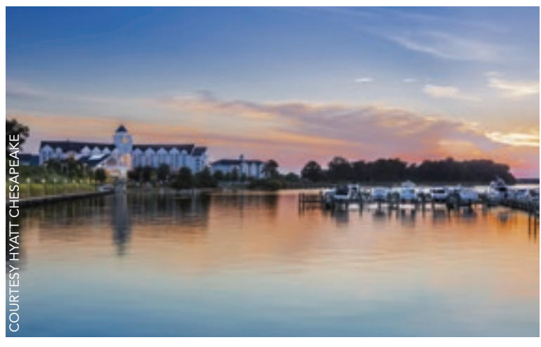
World-class Resort: Situated on the banks of the Choptank River, the Hyatt Regency Chesapeake Bay Golf Resort, Spa and Marina is ideal for family vacations, weekend getaways, and business retreats.