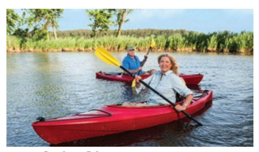
Outdoor Adventure: Enjoy birdwatching, cycling, hiking and paddling throughout the county and at the 28,000-acre Blackwater National Wildlife Refuge.