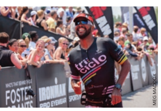
IRONMAN Event: The only full distance IRONMAN on the East Coast brings thousands of endurance athletes and supporters to Cambridge each Fall.