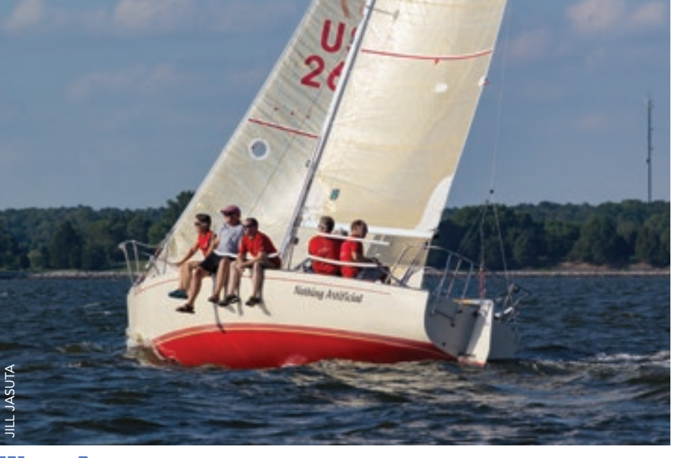
Water Access: Cambridge is a paradise for recreational boaters, anglers, and competitors. Our deep harbor marina provides immediate access to the Choptank River and Chesapeake Bay.