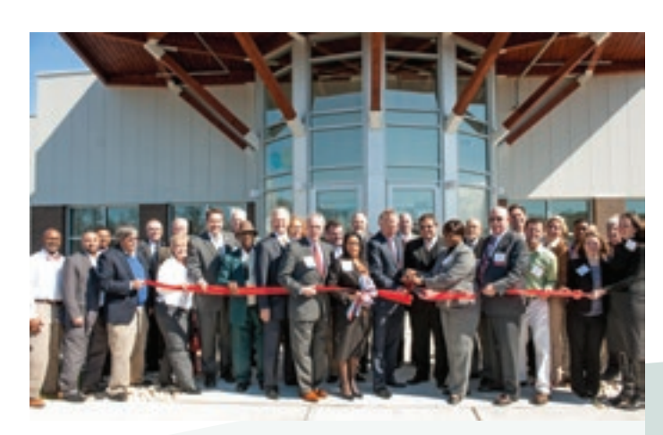
The Eastern Shore Innovation Center, the Tech Park's anchor tenant, opened in 2016.